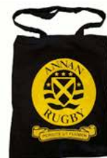
Tote Bags £2.00