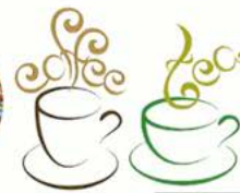
Sweets / Hot & Cold Drinks £ various