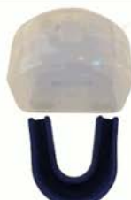
Gum Shield £3.00 Junior & Senior