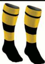
Socks £8.00 per pair S 12-2, M 3-6, L 7-11