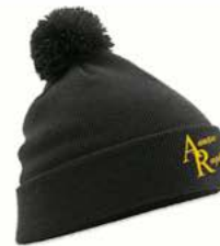
Bobble Hat £9.00