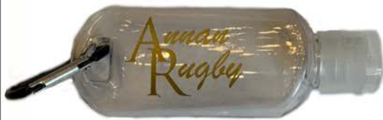
Mini Sanitizer Bottle with Belt/Keyring Grip £4.00

THANKS TO MACC DESIGN STUDIO 41 HIGH STREET ANNAN